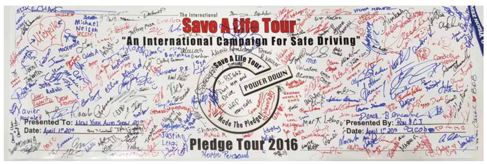
Dozens of teens and parents signed the banner pledging not to drive distracted.

NRSF organized and hosted the first Teen Driver Safety Day at the New York International Auto Show in the Big Apple in April.