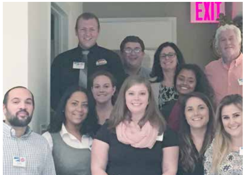
SADD staff and student leaders with NRSF staff

Our friends at SADD celebrated their 35th anniversary in New York, where the Student Leadership Council gathered for its annual planning session and to meet with The National Road Safety Foundation's team to work on next year's #DrivingSkills101 program, which we sponsor. Before the day's meetings began, the group walked a few blocks over to Rockefeller Center, where they gathered with "SADD 35" signs on the Plaza where The Today Show tapes. We're told they got some on-camera time. Congrats and Happy Anniversary.